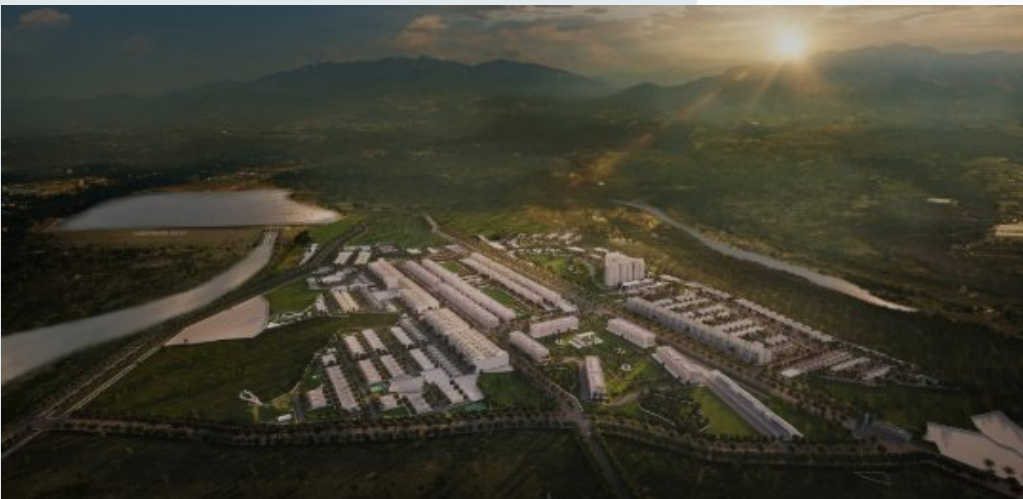
Picturesque DLF Valley Campus