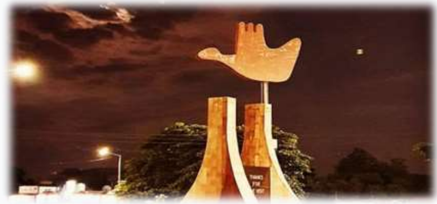
Open Hand, symbol of Chandigarh at Panchkula