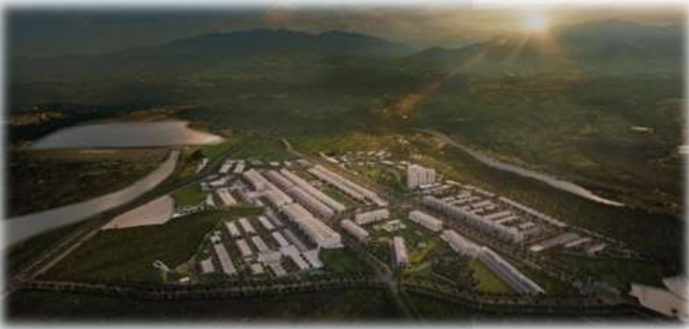
Picturesque DLF Valley Campus